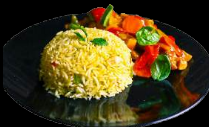
Fish Fillet in Sweet & Sauce

Pineapple infused basmati rice with well marinated prawns, stir fried with vegetables for that tropical sensation.