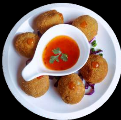
Chicken & Meat Croquette