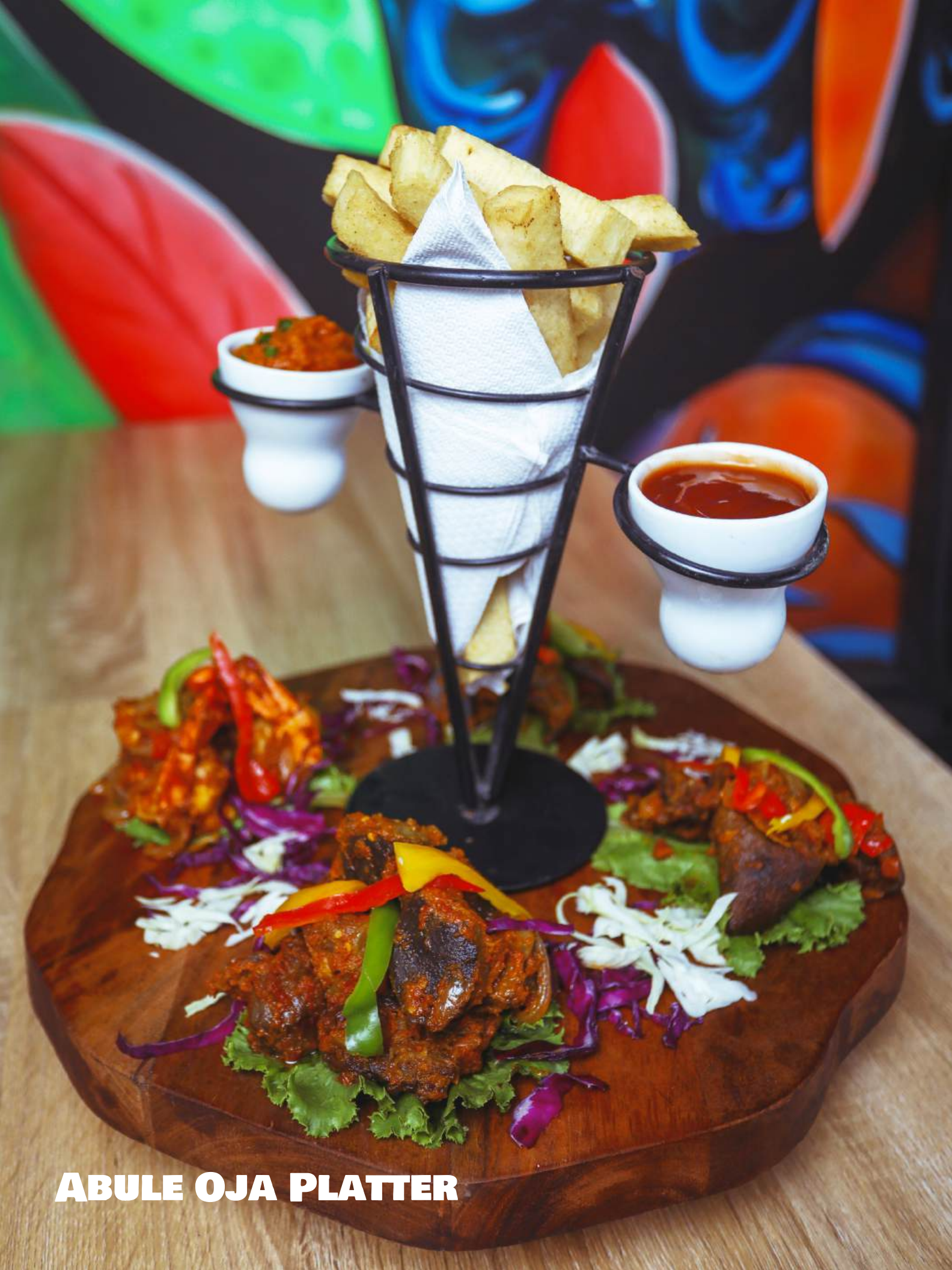
ABULE OJA PLATTER