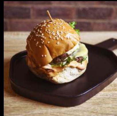
03 Classic Beef

Our signature shawarma dish, hand crafted to perfection with wings and french fries.