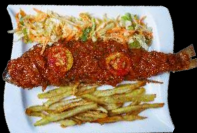
Grilled Croaker Fish